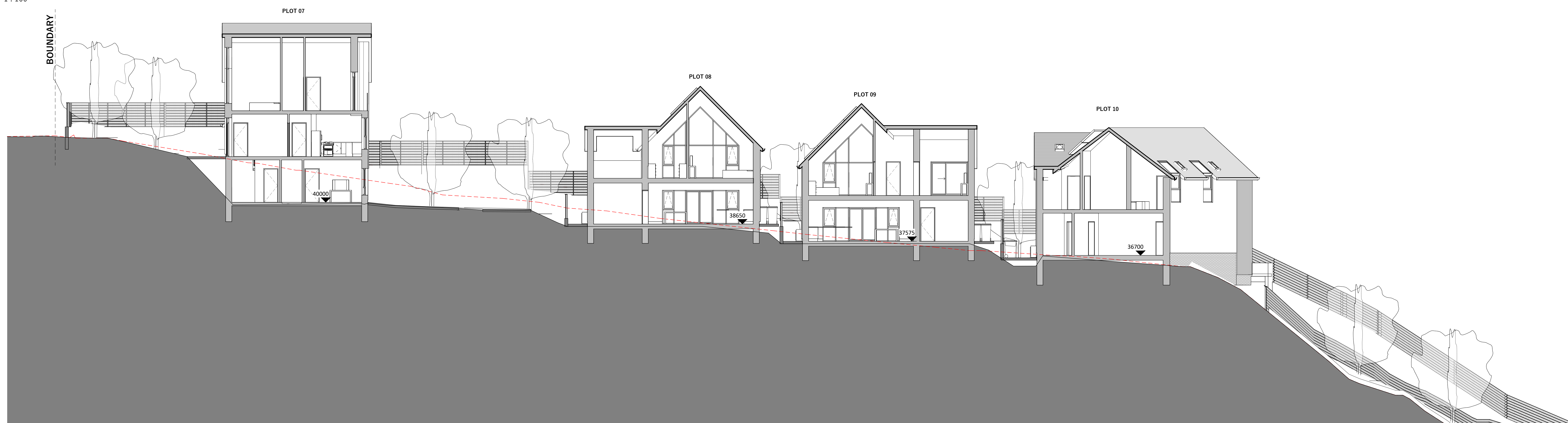
SECTION 03 SCALE: 1:100