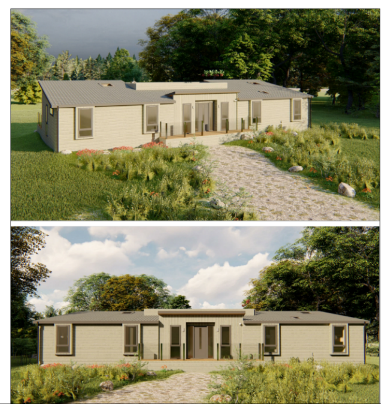
Illustrative 60' x 22' Lodge (to NW Corner of Site)