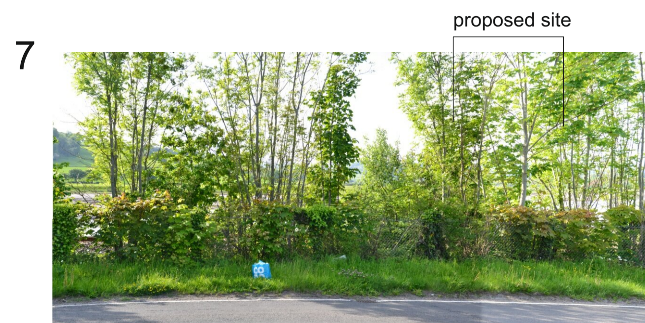
Viewpoint V7 - North-westward views from A470 adjacent entrance to Bodnant Welsh food. 50 mm lens