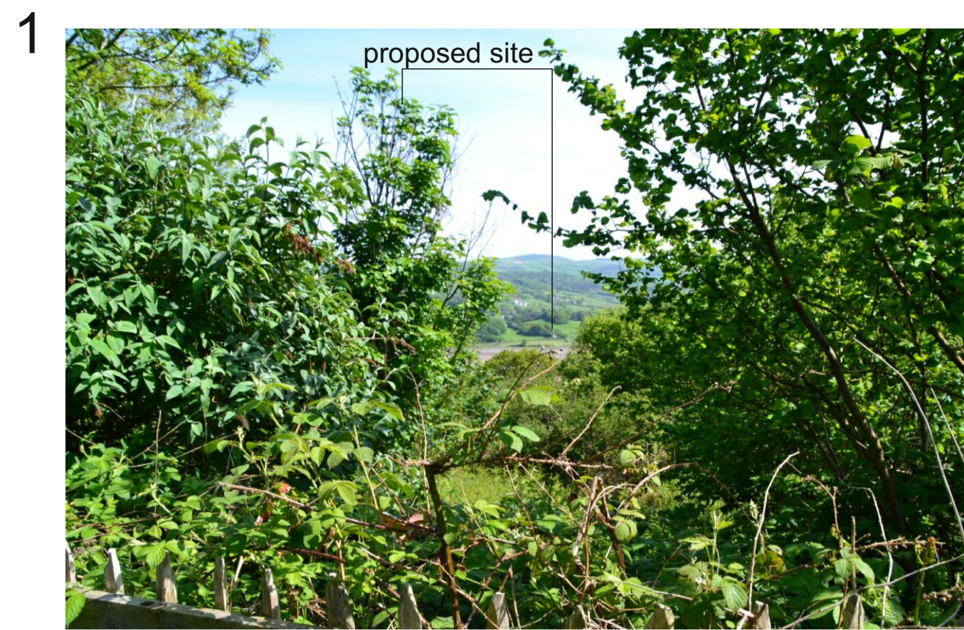
Viewpoint V1 - Public footpath running through caravan site. 50 mm lens