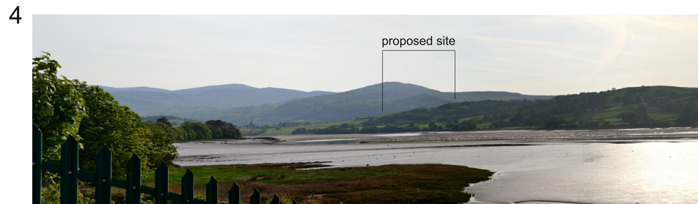
Viewpoint V4 - Westward view from bus stop on A470 opposite Trem Afon. 50mm lens