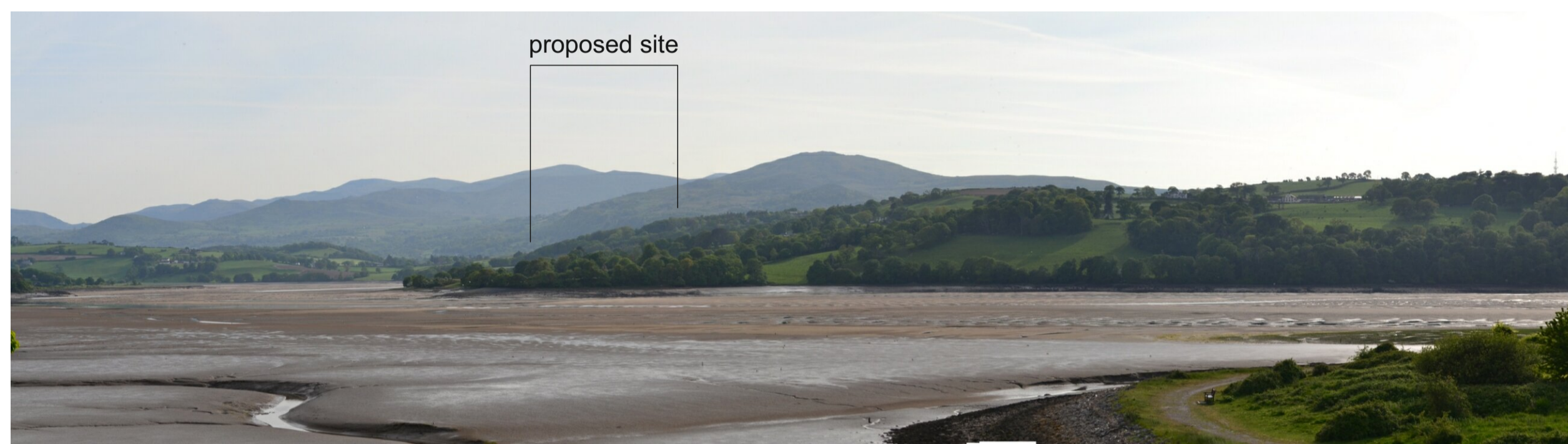
Viewpoint V3 - Westward views from public car park and viewing area on A470. 50 mm lens