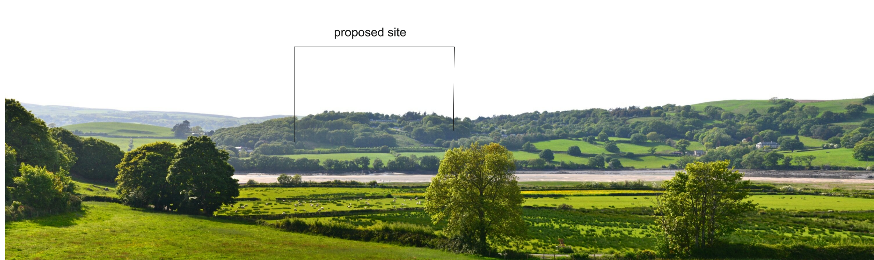
Viewpoint V5 - North-westward views from Public Footpath running parallel with River Conwy, Bryniau. 50 mm lens