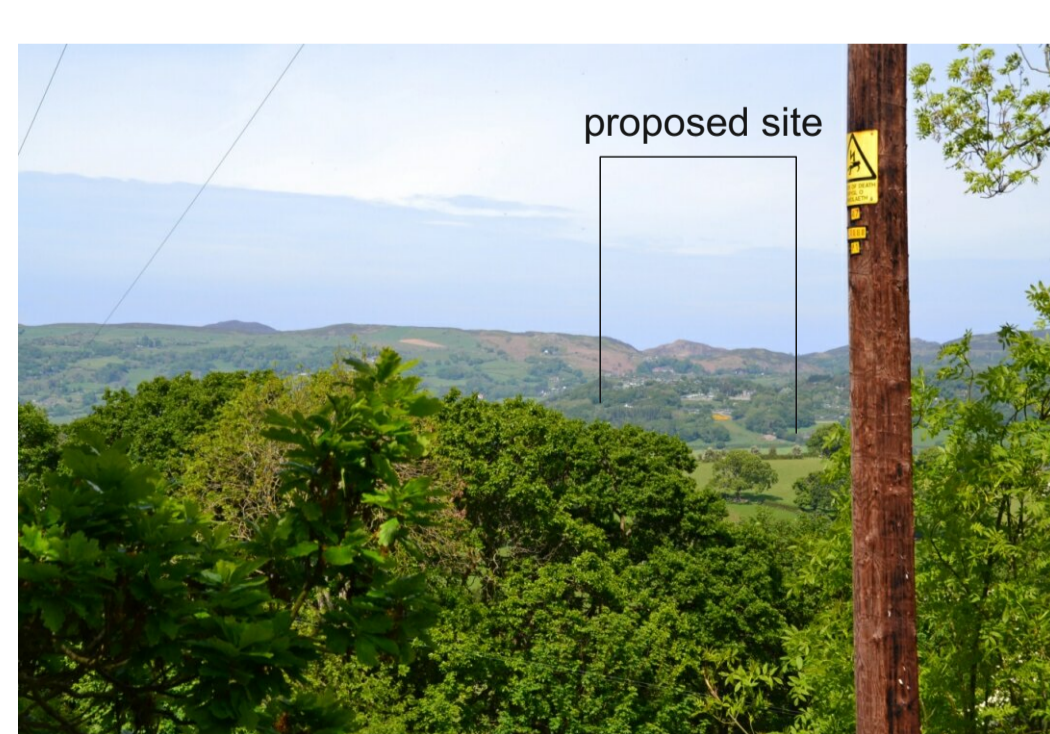
Viewpoint V6 - North-westward views from high ground close to Prenol summit. 50 mm lens