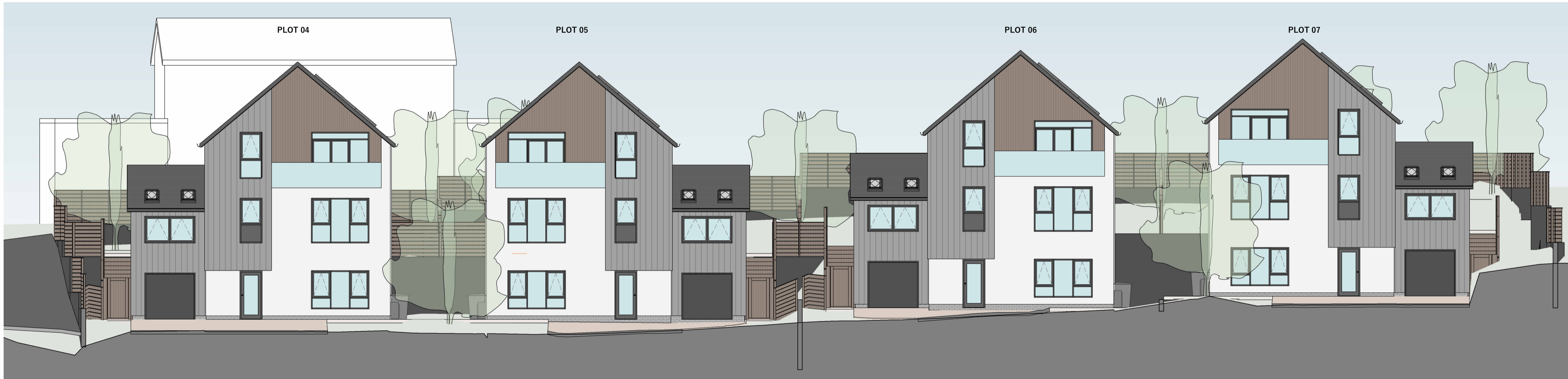
STREET ELEVATIONS 04 SCALE: 1 : 100