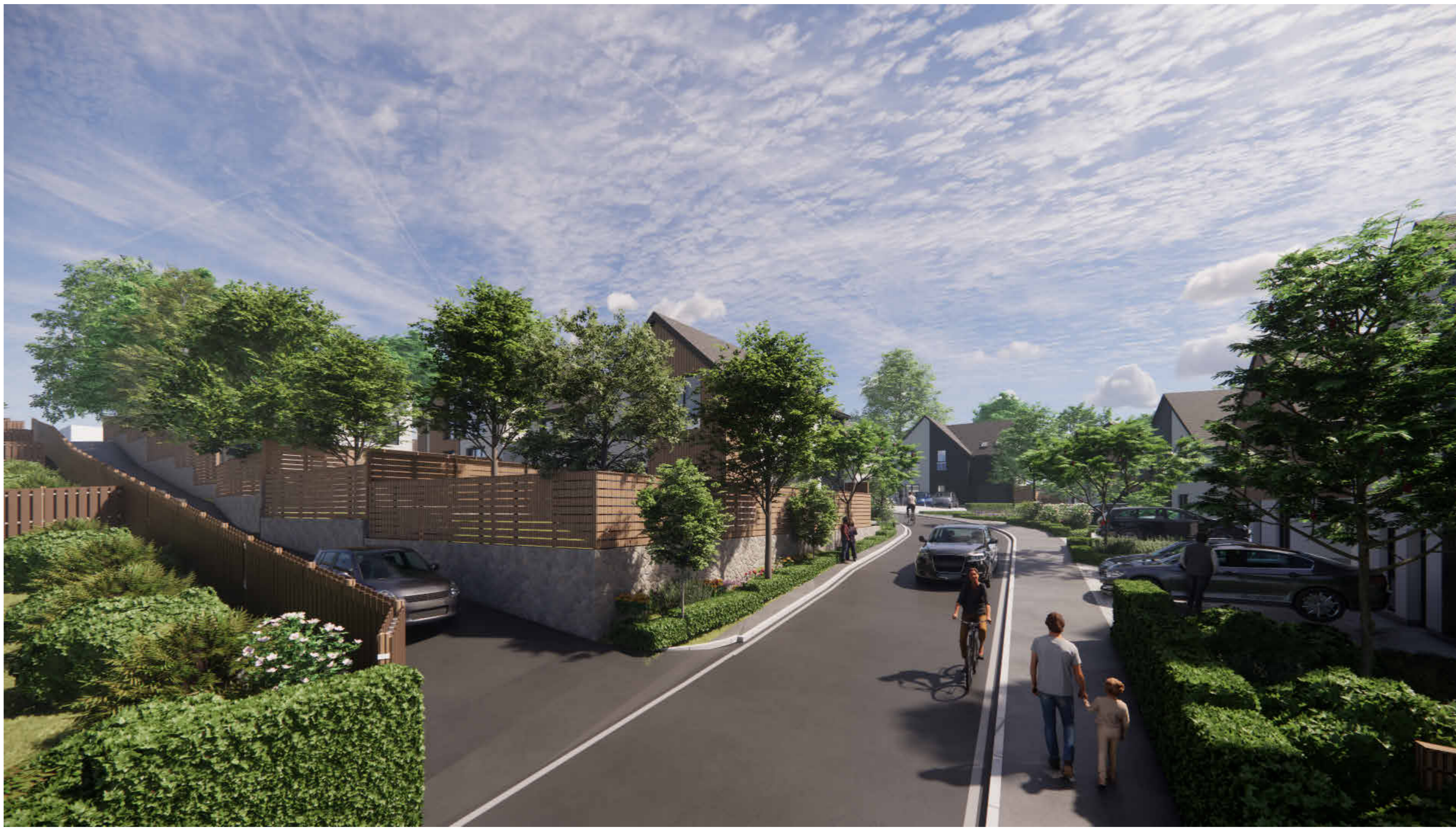
3D VIEW 2