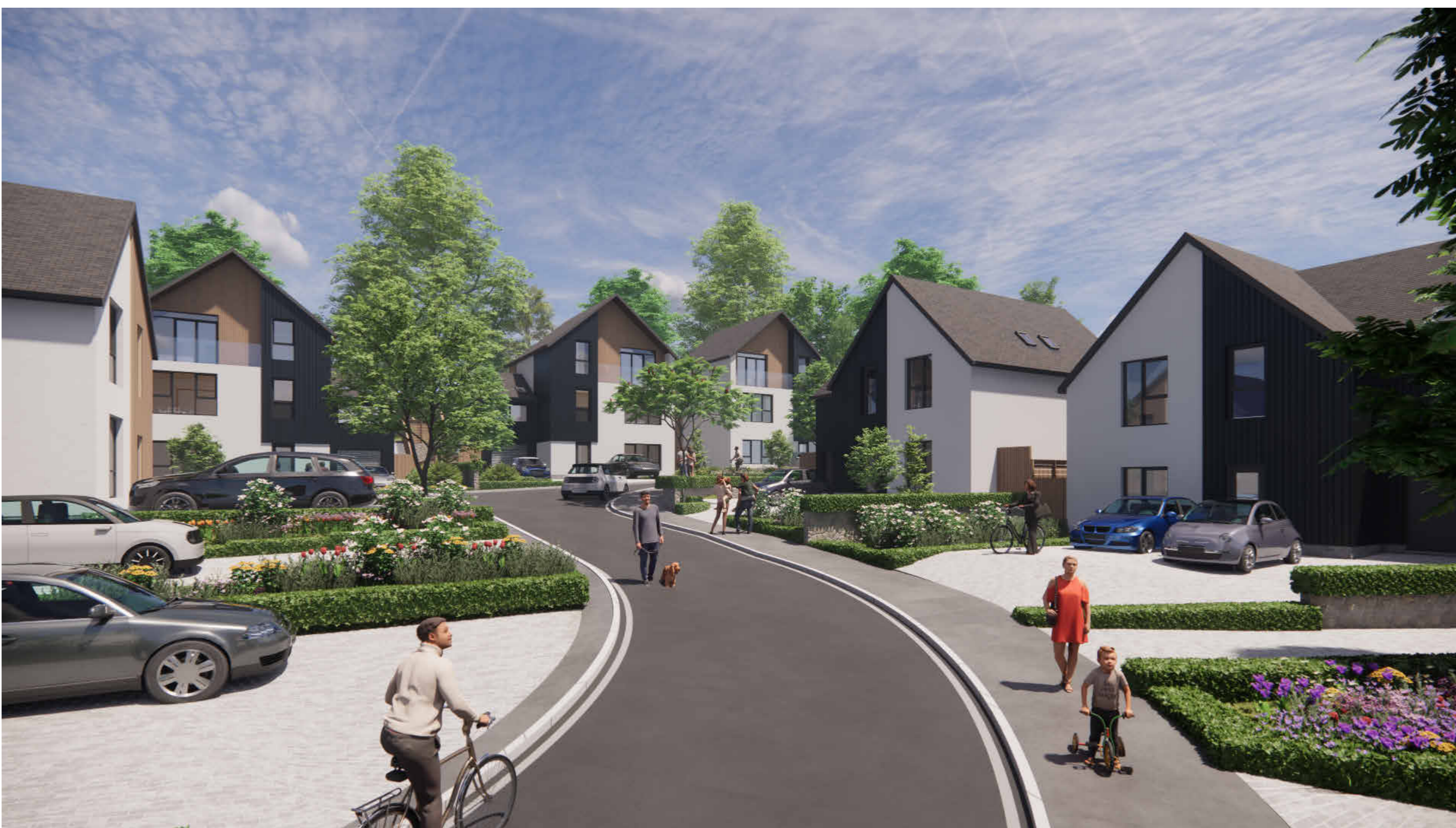
3D VIEW 3