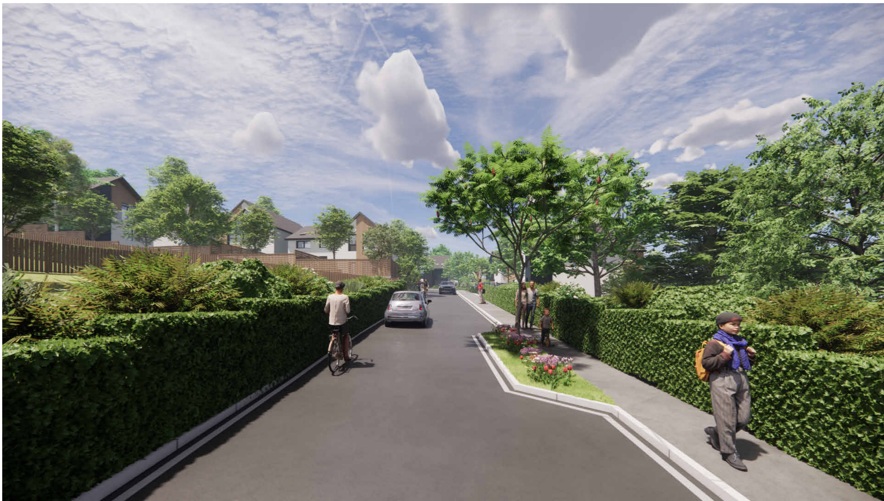
3D VIEW 1