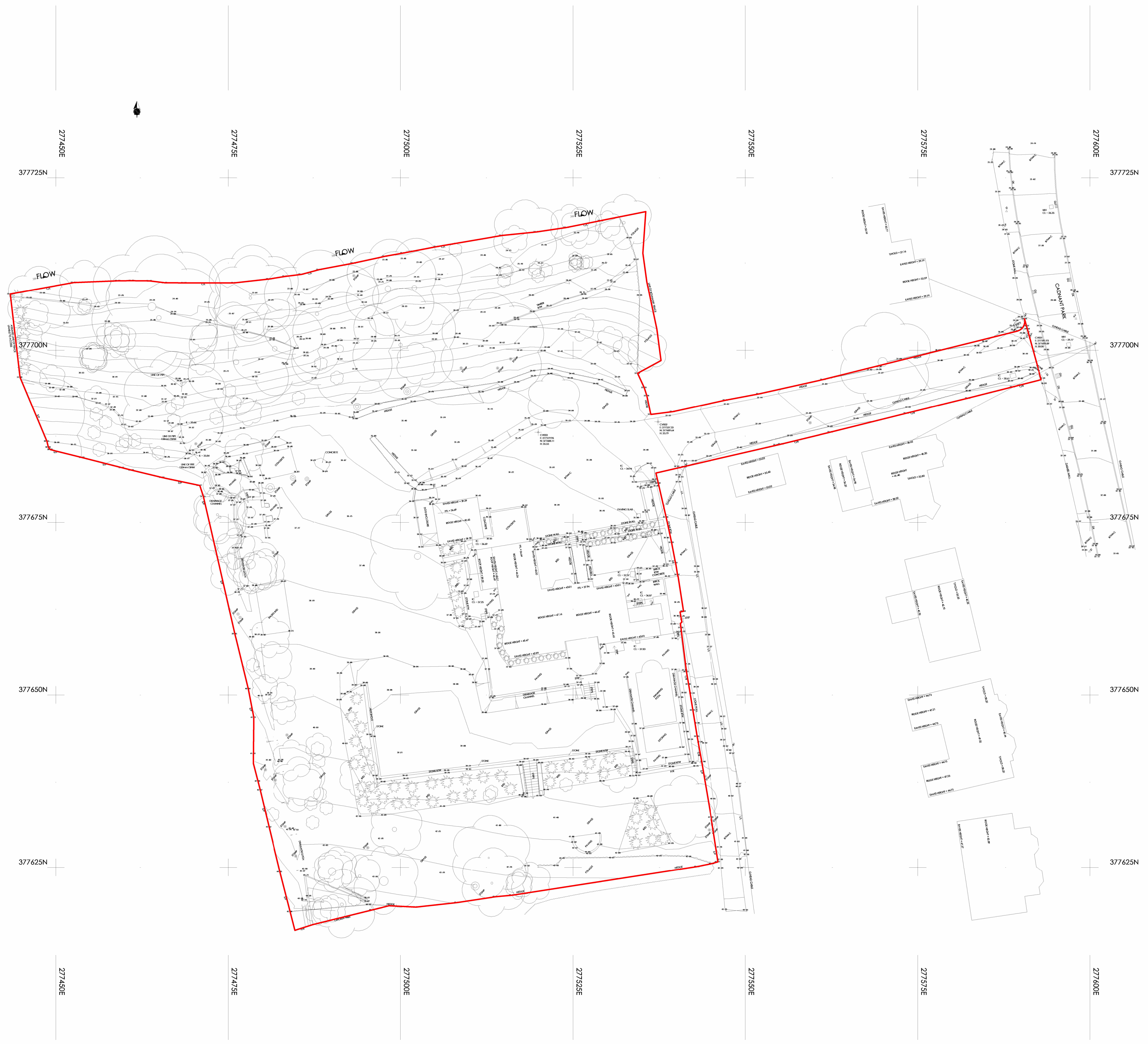
EXISTING SITE PLAN SCALE: 1:200