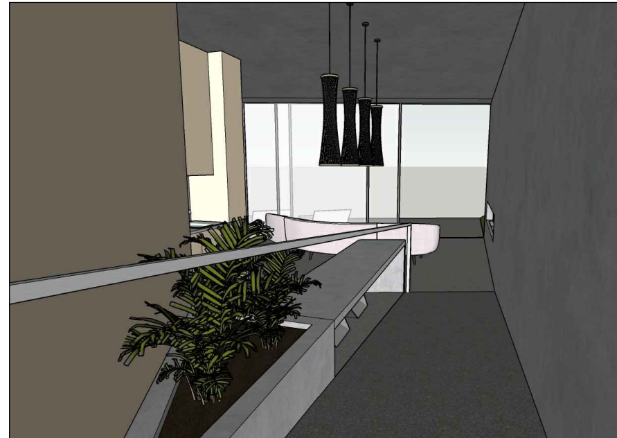
Single Bed Pod - Hall Way Visual