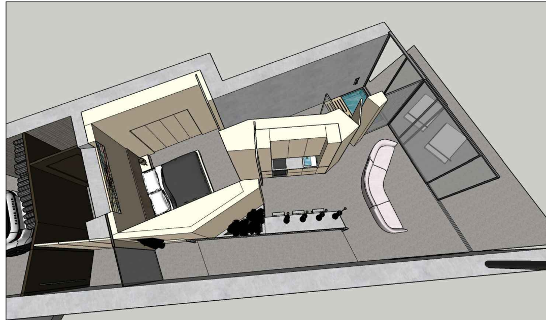
Single Bed Pod - Aerial Visual

Copyright: All rights reserved. This drawing must not be reproduced without permission. This drawing must not be scaled. Dimensions are in millimetres unless specified.