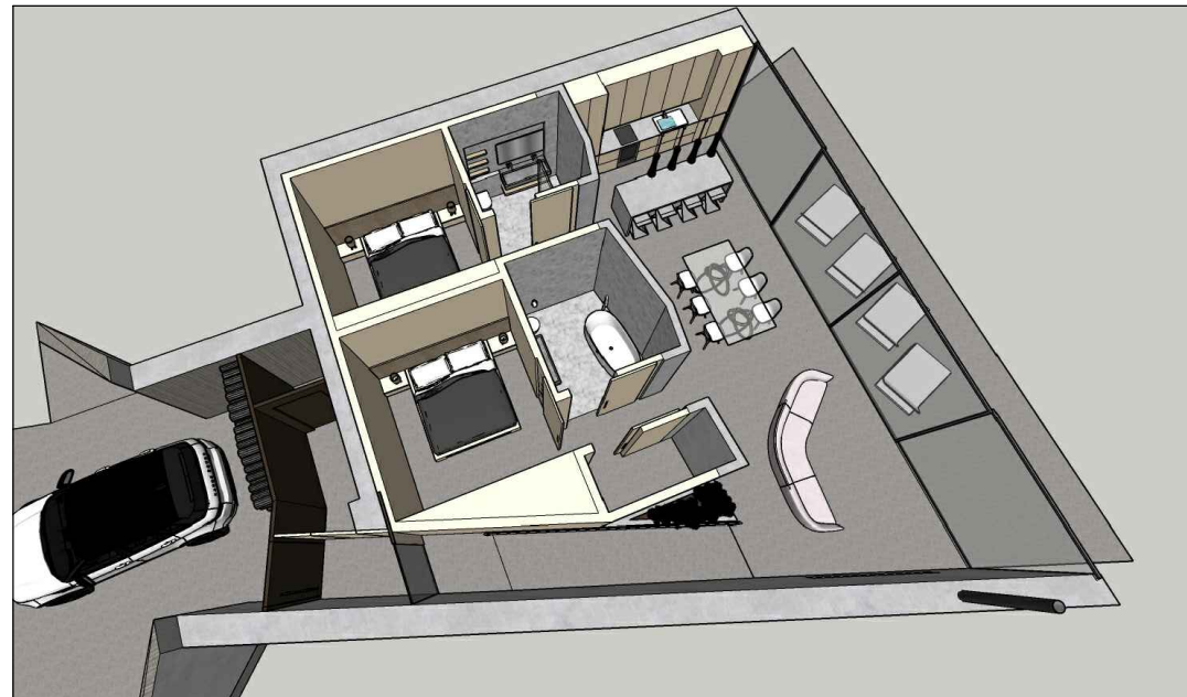
Double Bed Pod - Aerial Visual