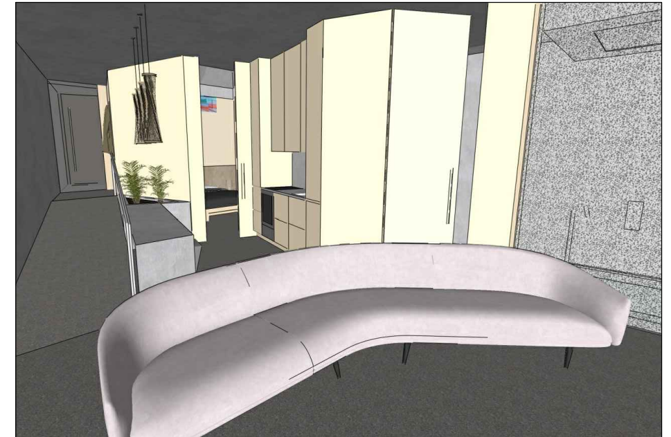
Single Bed Pod - Lounge/Kitchen Visual