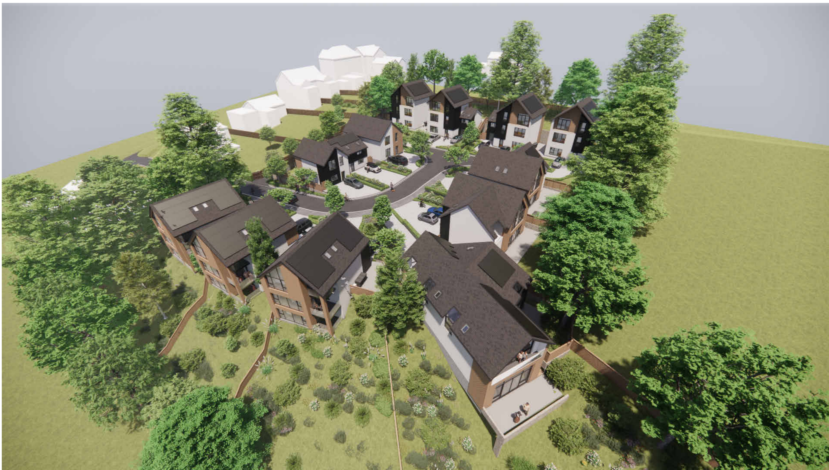
3D VIEW 10