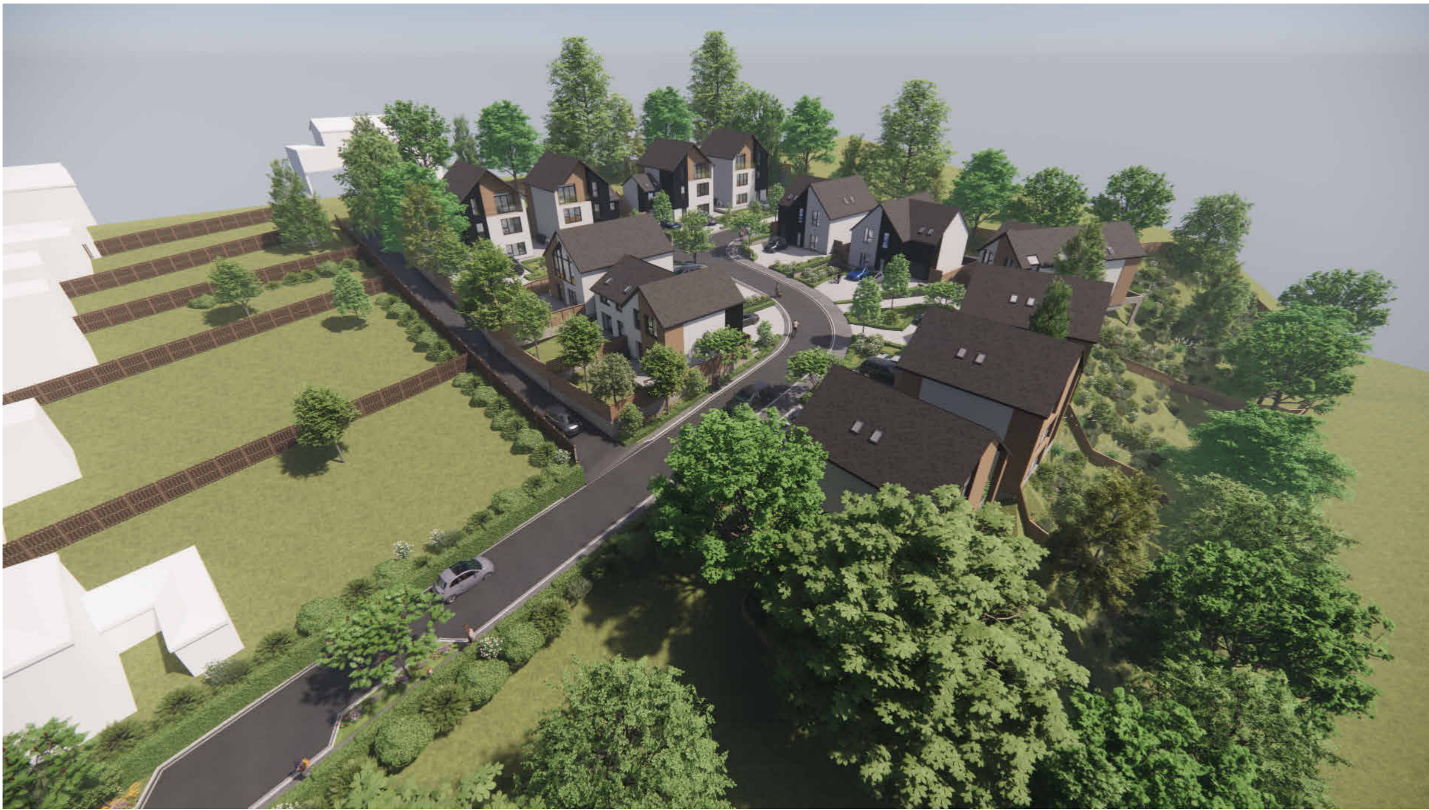
3D VIEW 11