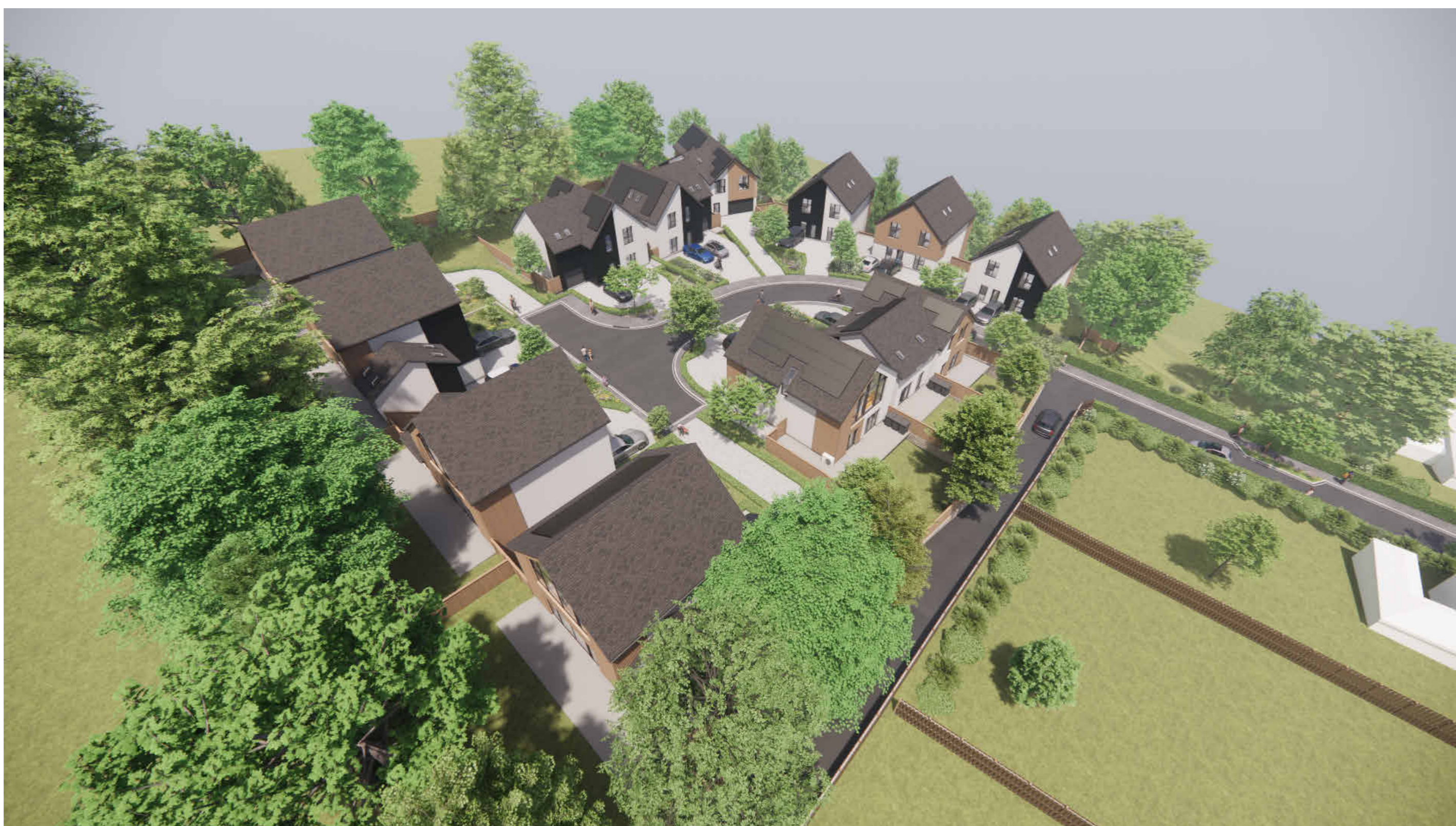
3D VIEW 12